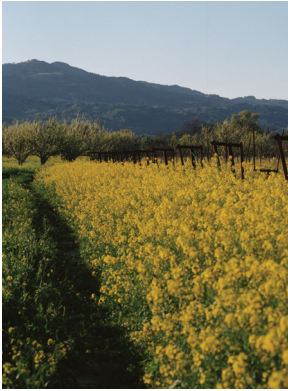
Blossoming mustard plant in early morning